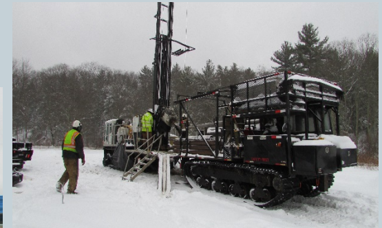
Test Drilling for new Water Source