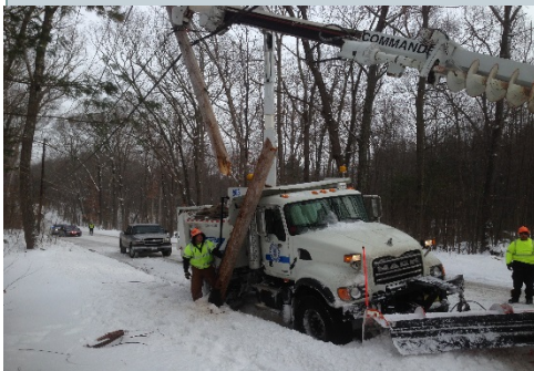
State plow meets PUD Pole