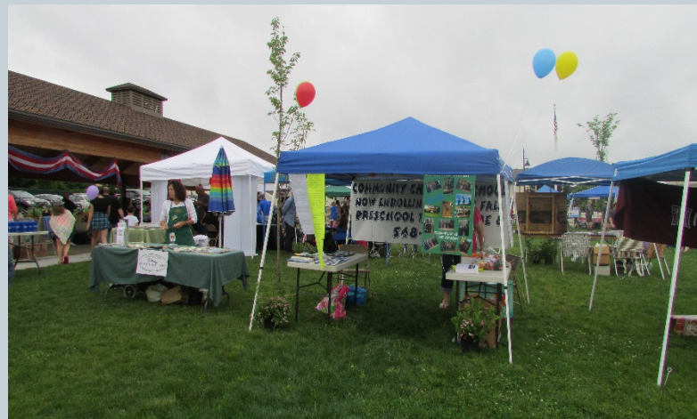
Pascoag Utility District & Burrillville Parks and Recreation - 2014 Green Festival -